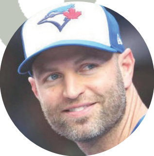
J.A. Happ, Class of 2001, Major League Baseball Pitcher, Retired